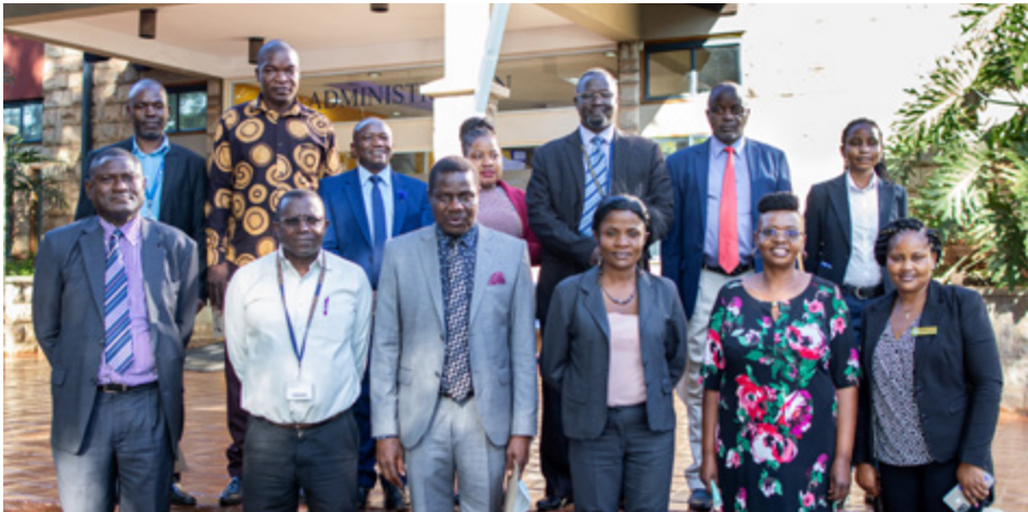
The Zimbabwean delegation pose for a photo after their visit to USIU Radio on a benchmarking mission.

On Wednesday, November 17, a Zimbabwean parliamentary delegation visited the School of Communication, Cinematic & Creative Arts (SCCCA), specifically USIU's 99.9 FM radio station on a fact-finding mission. The parliamentarians who are members of Committee on Information, Media and Broadcasting Services were on a benchmarking mission to local community radio stations following consultations with senior officials of the country's telecommunications regulator, Communications Authority of Kenya (CA) on the country's vibrant broadcast industry.