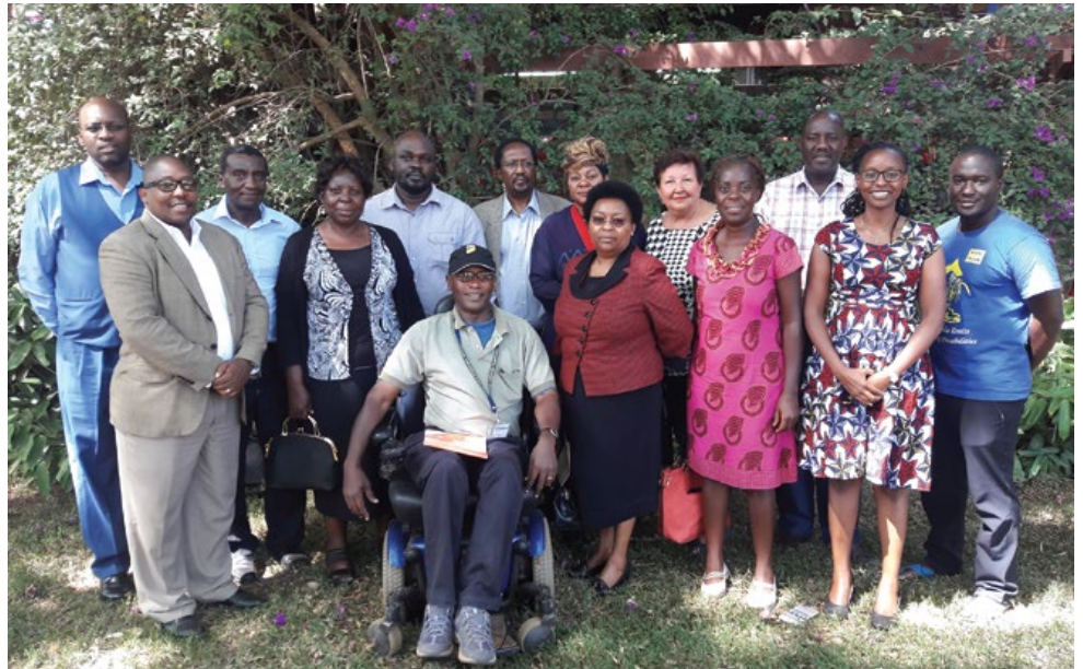
Above: Members of the Institutional Review Board following a training session held on campus.

All researchers will now be required to seek approval from USIU-Africa’s Institutional Research Board (IRB) to proceed with their research. The Board, which was formed following the university’s accreditation by the National Commission for Science, Technology and Innovation (NACOSTI), is mandated to review, approve and oversee research proposals involving primary data. This will safeguard research integrity by ensuring ethical procedures are followed.