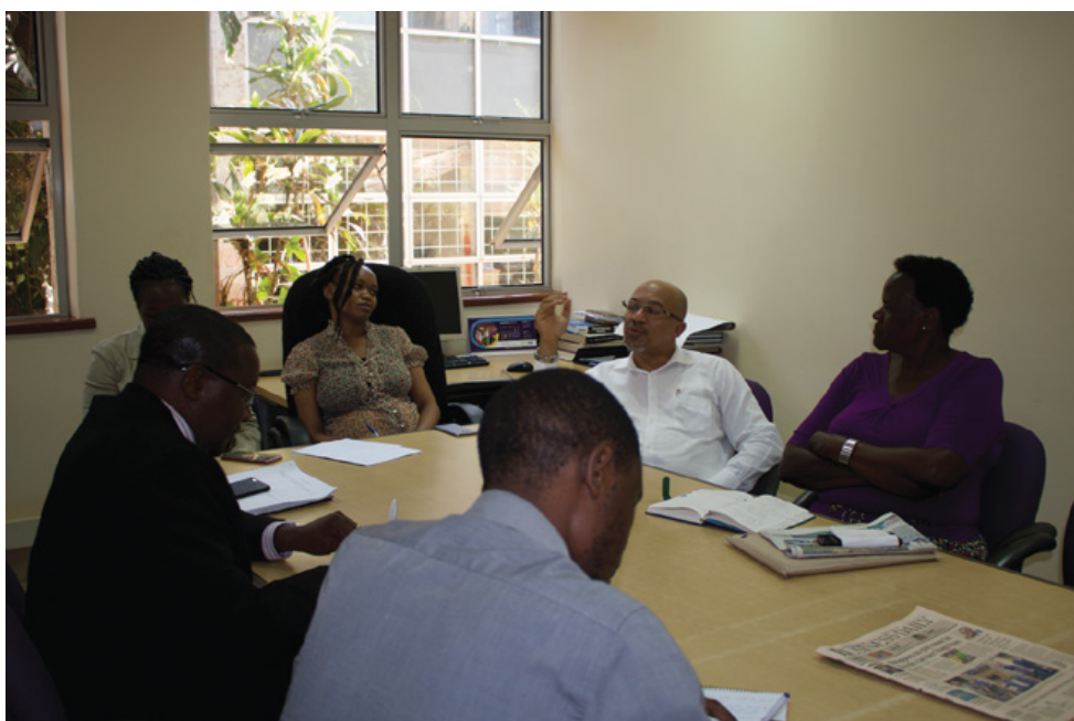
Members of Alumni department host Alumni from the DBA program during its review