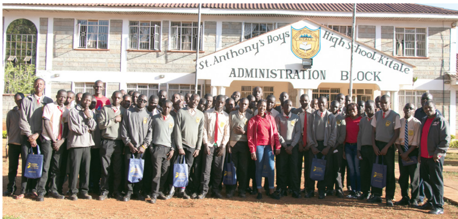
The Admissions team together with St. Anthony Boys High School Kenya Certificate of Secondary Education (KCSE) candidates pose for a photo during an admission drive at the school premises in Kitale on Saturday, March 30.