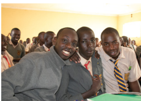
Three Kenya Certificate of Secondary Education (KCSE) candidates pose for a photo during the Admissions drive at St. Anthony Boys High School in Kitale on Saturday, March 30.