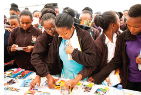
Students of Karima Girls peruse brochure content of the courses offered at USIU-Africa