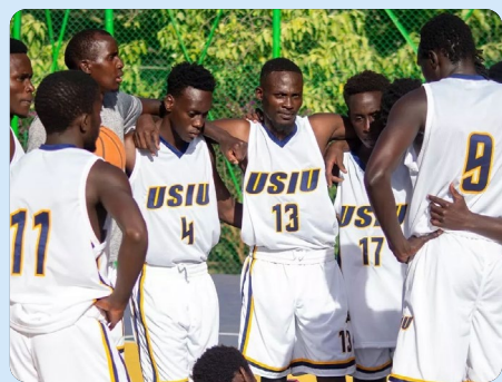
Tigers have a moment during their clash against Strathmore Blades.

The USIU-Africa Tigers, the basketball men's team, had two matches on Saturday, February 4. First, they faced Grets University in a Kenya University Sports Association (KUSA) match in Kenyatta University (KU) which they clobbered them 71-30. The final match of the day was between the Tigers and Strathmore Blades in a Kenya Basketball Federation (KBF) division one