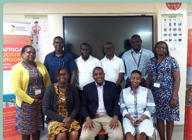
The Confucius Classroom Board Members during their meeting held last month.

The Confucius Classroom at USIU-Africa began their official duty with a meeting on Monday, January 30, 2023. The aim of the Confucius Classroom is to promote Chinese language and culture, support local Chinese teaching internationally and facilitate cultural exchanges.