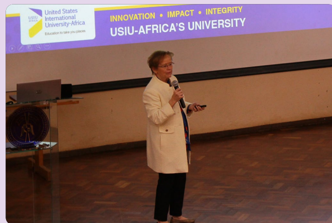
The Vice Chancellor during the Community- wide Baraza held on Wednesday, February 15 to discuss the re-focused University Strategic Plan, which was revised to respond to the recent changes in higher education around the world, especially post COVID-19, as well as all the emerging global issues. The Baraza provided an opportunity for staff, students and faculty to share their feedback on the revised Strategic Plan.