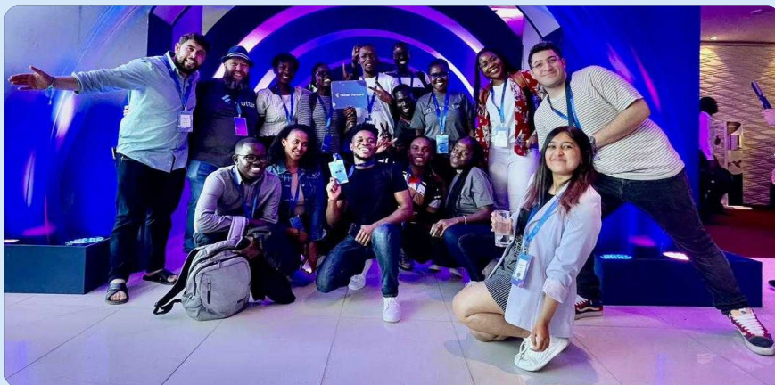
Attendees at the Flutter Forward event. Flutter is Google's mobile UI framework for crafting high-quality native interfaces on iOS, Android, web, and desktop.

Last month, USIU-Africa hosted the Flutter Forward event organized by the Google team. The event was an invite-only gathering of Flutter developers, product managers, and the Google Flutter team.