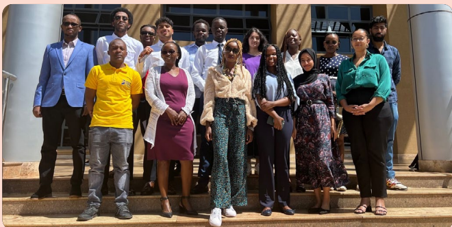
The students from the Department of International Relations who are currently in the United States for their academic tour.

Over the last ten years, the department of International Relations has prepared students to participate in the Harvard National Model United Nations (HNMUN), an annual simulation conference targeting student across the globe.