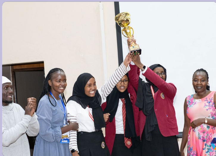
The Debate champions, Kinderworld International School receive their trophy at the end of the two-day event.