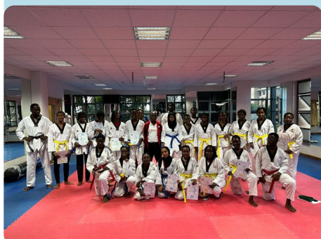
Taekwondo team displaying their newly graded belts and certificates.

The USIU-Africa Taekwondo team had their grading ceremony on Saturday, April 1 in the USIU-Africa Martial Arts room. The order of Taekwondo belts (in ranking) typically goes: White, Yellow, Green, Blue, Red, Brown, and Black. Their members were graded 16 Yellow belts, 5 Green belts, 4 Blue belts and 2 Red belts.