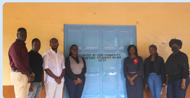
The refurbishing of Mji wa Huruma was done as part of Community Service.