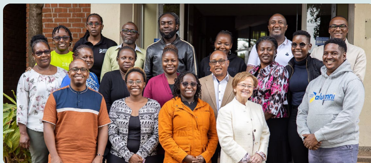
Some of the staff members who attended the staff alumni breakfast with the Vice Chancellor last Friday at Utalii Hotel.