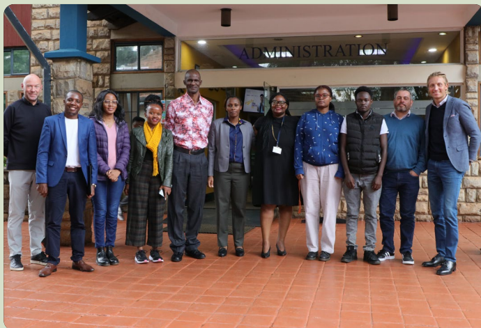
The teams from Exness and USIU-Africa during a meet and greet session with Exness Scholars.