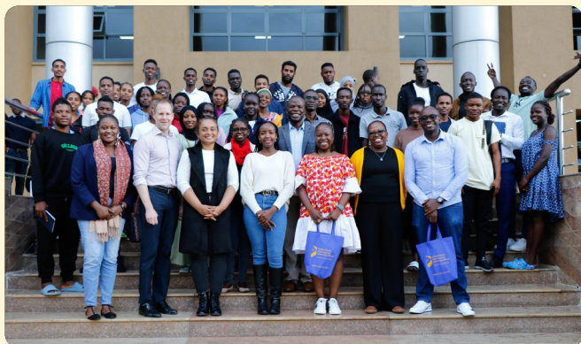
The WUSC team pose for a photo with the Mastercard Foundation Scholars and the Mastercard Foundation Scholars Program team at USIU-Africa. WUSC was on campus to engage with Mastercard Foundation Scholars with backgrounds of forced displacement that are enrolled in the Mastercard Foundation Scholars Program at USIU-Africa.

The Mastercard Foundation Scholars Program at USIU-Africa welcomed a delegation from the World University Service of Canada (WUSC), one of the Program's technical partners that supports and facilitates access to higher education for refugee and forcibly displaced (RDP) young people.