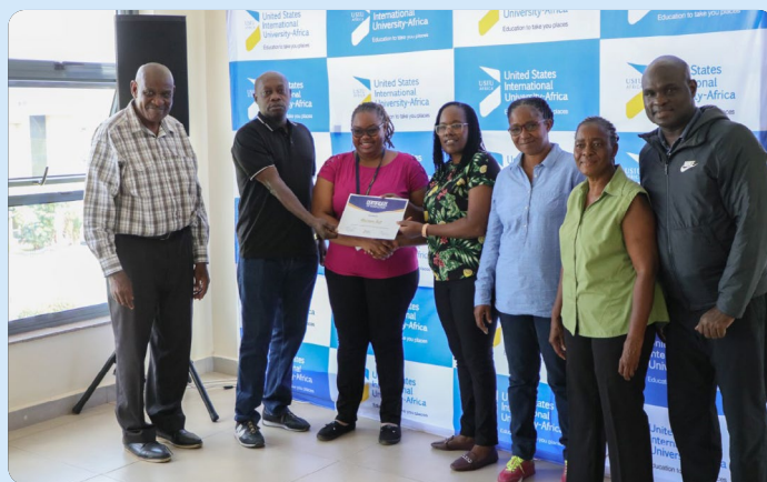
Students receive their certificates after successfully completing the several courses on offer at the Department.

The Languages and Literature Department in the School of Humanities & Social Sciences held a certificate awarding ceremony for students who completed certificate courses in English, French, Chinese, Spanish, Swahili, Basic Kenya Sign Language, and Advanced Kenya Sign Language. This significant event marked a culmination of rigorous study and practice, celebrating the achievements of students as they expand their linguistic capabilities and cultural understanding.