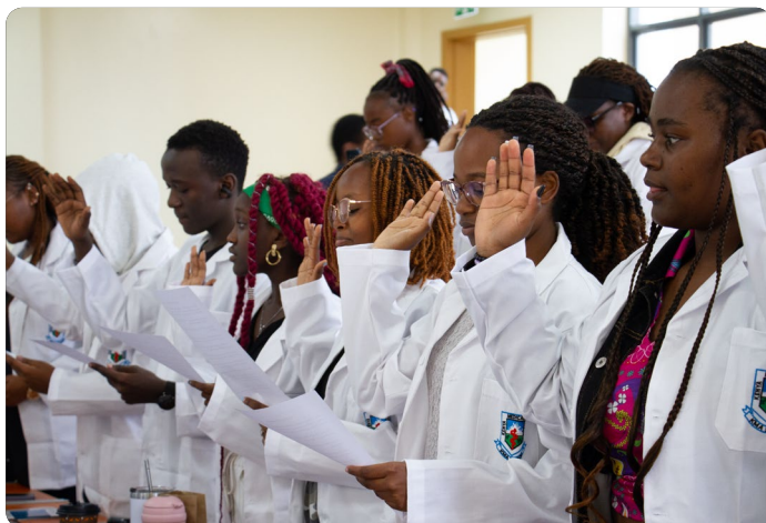
USIU-Africa pharmacy students take the pledge of professionalism during the White coat ceremony held last Friday.