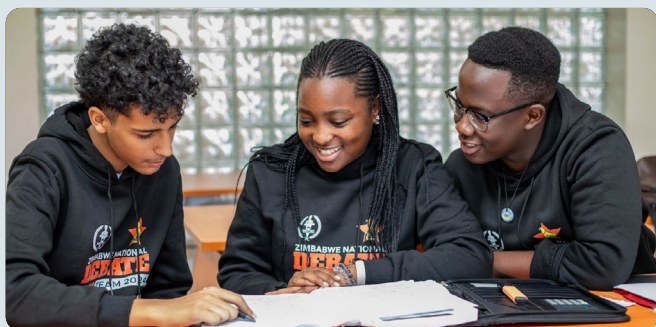
Students from the Zimbabwe National Debate team preparing for an impromptu debate round.