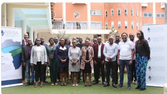
Participants during NIERA's first dissemination workshop for the "Gamified Savings as a Problem Gambling Intervention" research project held at Mövenpick Hotels & Resorts.