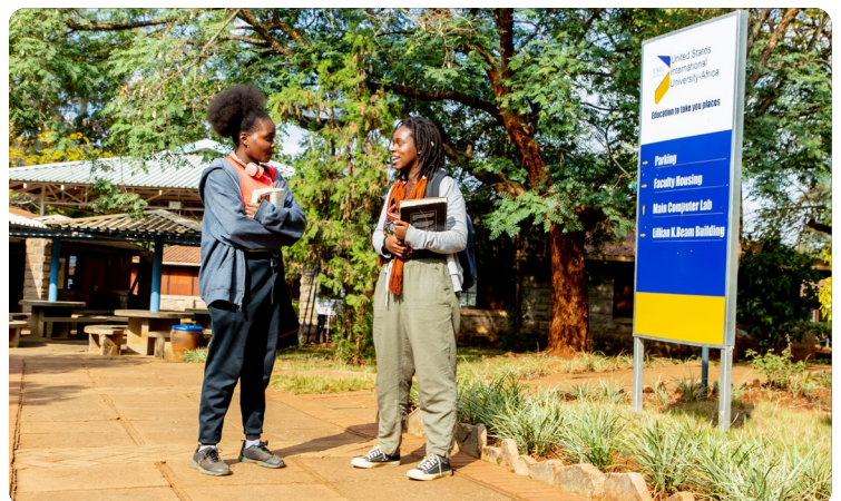
Students interact after attending a class on campus.