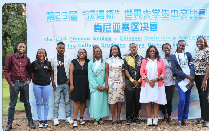
USIU-Africa students attend the 23rd Chinese Bridge competition at the University of Nairobi.

On Tuesday, May 14, three (3) Confucius Classroom at USIU-Africa students competed at the finals of the 23rd Chinese Bridge – Chinese Proficiency Competition for non-native university students' Kenyan division.