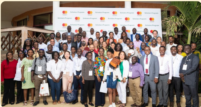
Participants during the Mastercard Foundation E-learning Summit that took place in Saly, Senegal from May 22-23, 2023.

The month of May was busy for the Mastercard Foundation Scholars Program eLearning Initiative. It started with the eLearning summit in Saly, Senegal (May 22-23), which hosted 60 partners from the Mastercard Foundation Scholars Program eLearning network who gathered to reflect on the progress the Initiative has made so far and the next steps ahead. In the next few months, participating institutions will express their interests for the next phase that seeks to implement and scale lessons learned in the last 2 years.