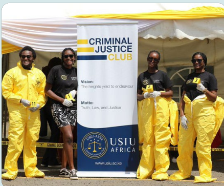
The Criminal Justice Club at their booth during the Clubs Week events held last week.

Clubs Week, organized by the Student Council Secretary General with the assistance of the Clubs' Week Committee, proved to be a resounding success. The three-day event held from Wednesday, June 7 to Friday, June 9, showcased the wide range of extracurricular clubs and societies available on campus while promoting student engagement and celebrating diversity.